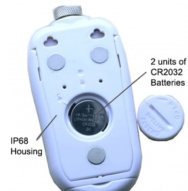
Temperature Probe Cable Structure