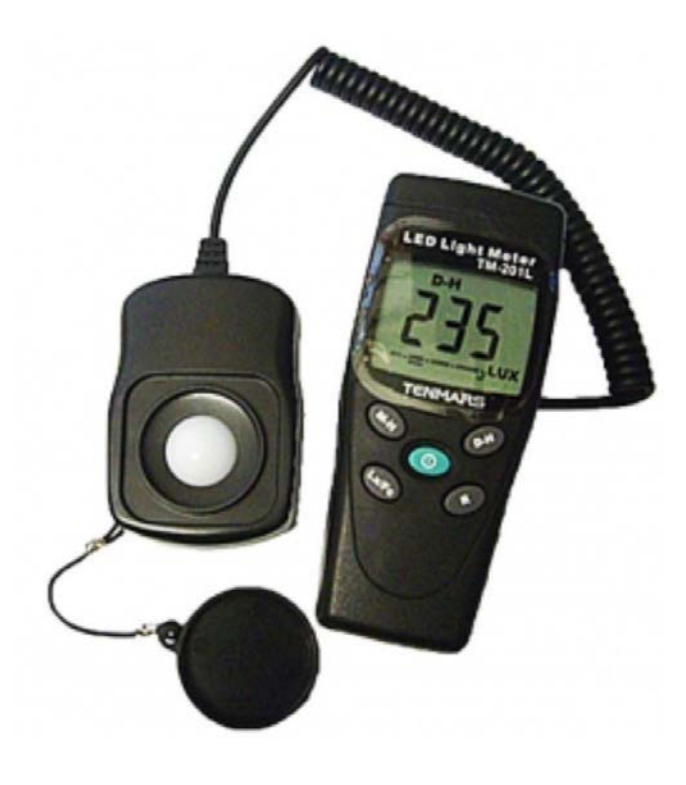
SKU: TENTM201LBK Manufacture warranty period: 12 months